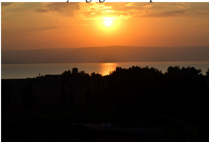
Sunrise over Galilee