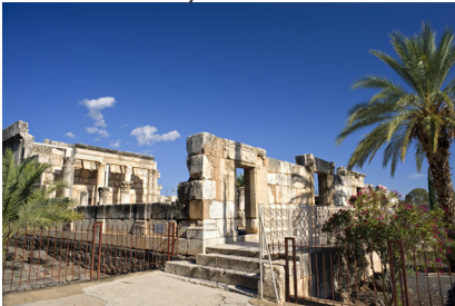
Ancient Synagogue at Capernaum