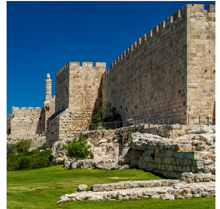
Jerusalem's Old City