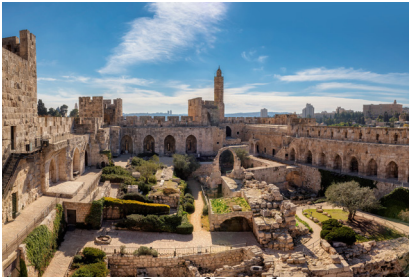
City of David